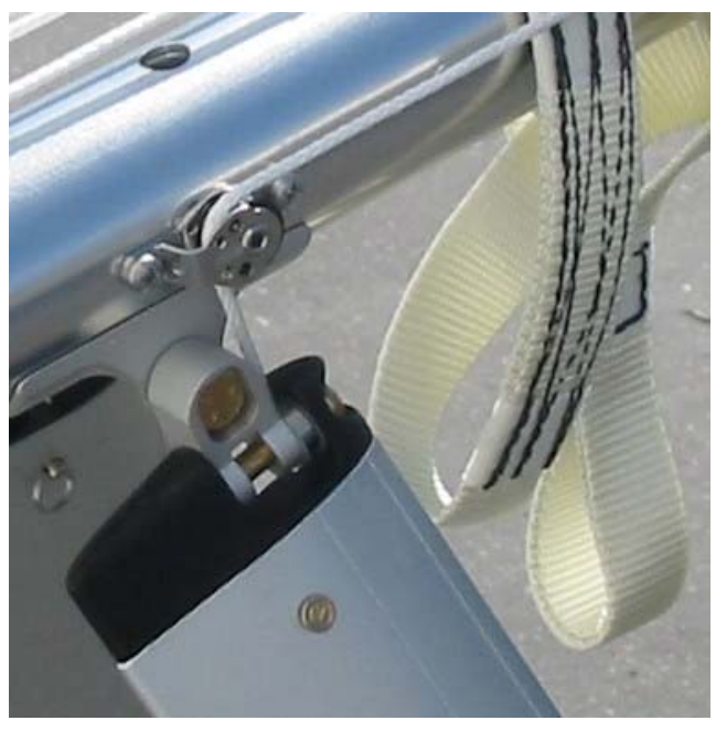
Talon with Slipstream