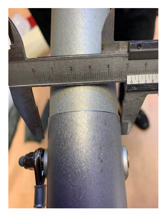
Sprog Bolt is overtightened, compressing the tube out of round